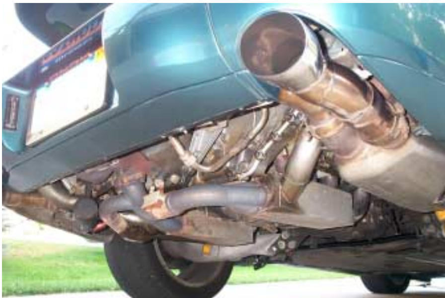
Right hand side of the exhaust

The engine exhaust gases pass from the exhaust manifold into the heat exchangers.