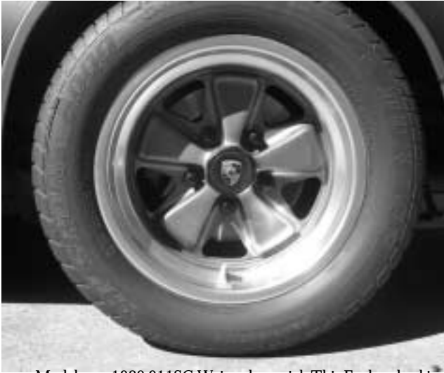
Model year 1980 911SC Weissach special. This Fuchs wheel is painted the same colour as the body.

The following table shows the different brands and types of tyres being used by 911SC in 2003. This is just a guide but it provides a wide range of selection to choose from.