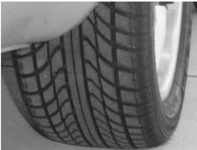
An example of modern day summer tyre tread patterns.